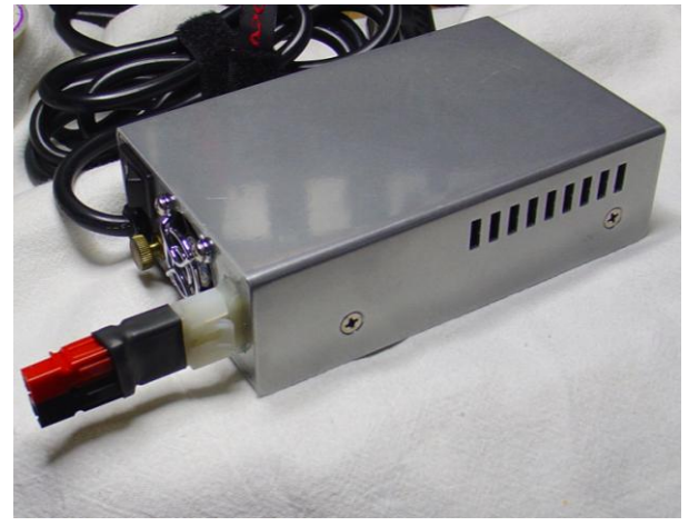
Separate pieces (below), complete adapter (above) Adapter plugged in to HPS-1a